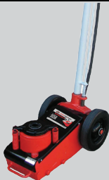
Model 522SD 22 Ton Super Duty Axle Jack