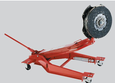
Model 3700 Clutch Jack

Guilderland Center, NY - 1-800-255-0555 - www.affjaxx.com