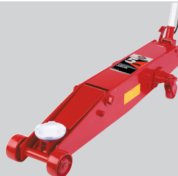
Model 3135 10 Ton Air / Manual Floor Jack