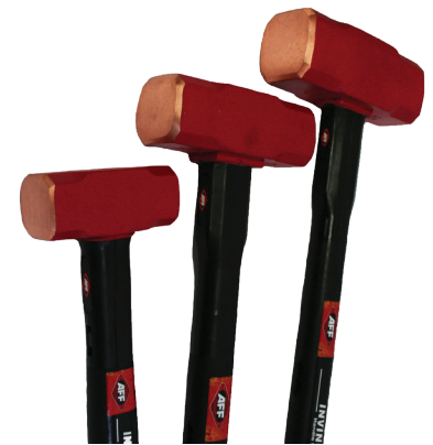
Copper Head Hammers